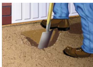
Dig trench 400mm wide, see chart opposite for channel and sump depths*. Mark finishing height with fixed line 3mm below final surface. Lay 150mm (min.) bed of concrete.