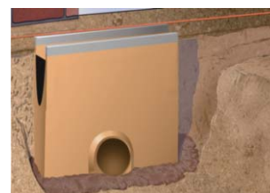
Knock out pre-formed outlet from the inside (marked with hammer symbol) and trim edges with a chisel. Fit outlet connector and sump. Position sump and outlet channel on concrete bed, fit PVC-U union/trap to drainage pipework.