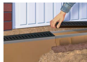
With gratings fitted, haunch around channels/sumps with concrete. Final surface to be 3mm above grating. Bricks/paviours should be laid in mortar for lateral stability.