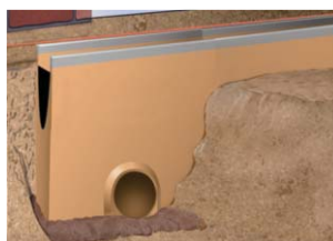
Lay channels starting from outlet/sump, ensuring joints connect by lowering units horizontally. Fit end caps to end channel. For watertight joints**, use a suitable sealant (contact ACO for further advice).